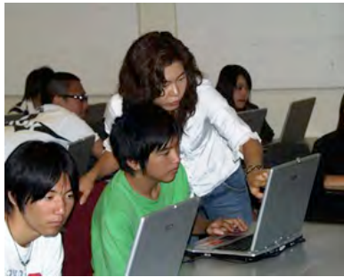
(Fig.13) High Tech Lecture