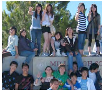
(Fig.14) Interchange with Mills high