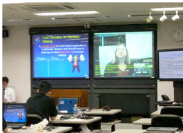
(Fig.10) Managerial Accounting