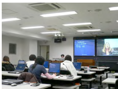
(Fig.5) Financial Accounting