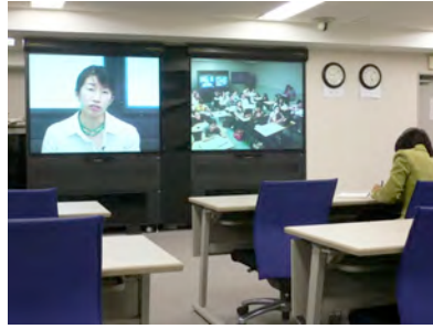
(Fig.8) UCD Asian Drama(10/23,25)