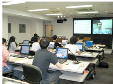
(Fig.11) Financial Decisions