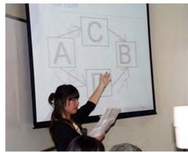
(Fig.15) Final Presentation