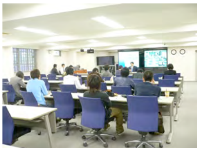
(Fig.4) Welfare Engineering