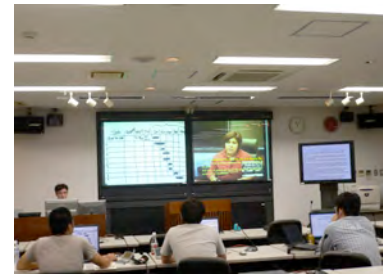
(Fig.11) Organization and Management