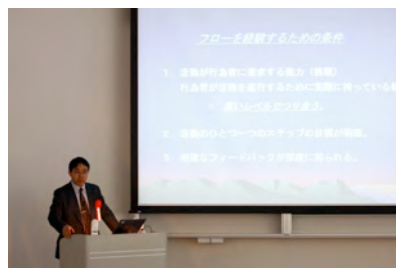
(Fig.16) Presence on Spring Research Conference 2007