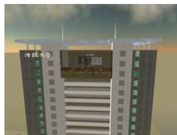
(Fig.3) Sky Hall view from BT