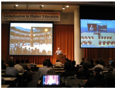
(Fig.7) Hosei – UCD Mini Symposium