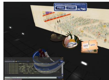
(Fig.3) Virtual Tour Ride