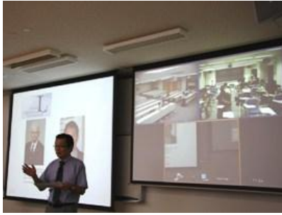
(Fig.4) Welfare Engineering