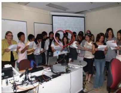
(Fig.14) Final Presentation from San Francisco