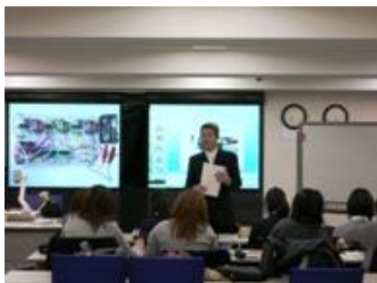
(Fig.13) High Tech Lecture