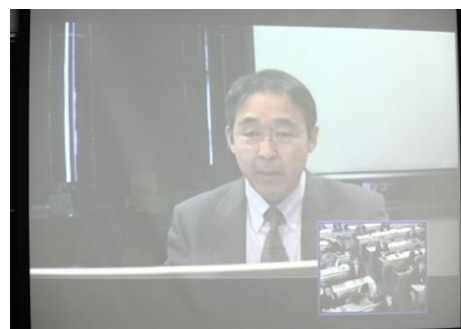
(Fig.17) Spring Research Conference 2008