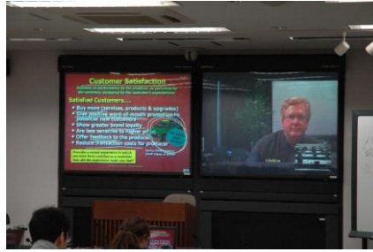
(Fig.5) Marketing Principles