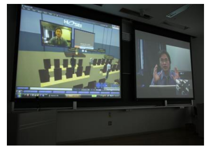
(Fig.9) Spring Research Conference 2008