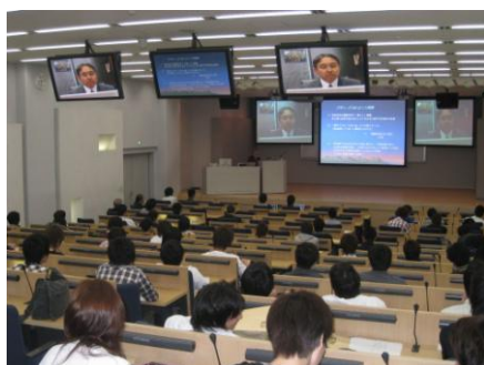
(Fig.16) Lecture to Engineering Freshmen