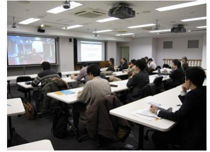
(Fig.6) Special Seminar on Advanced Analog/Mixed-Signal & RF Topics