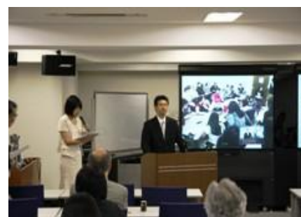
(Fig.15) Final Presentation